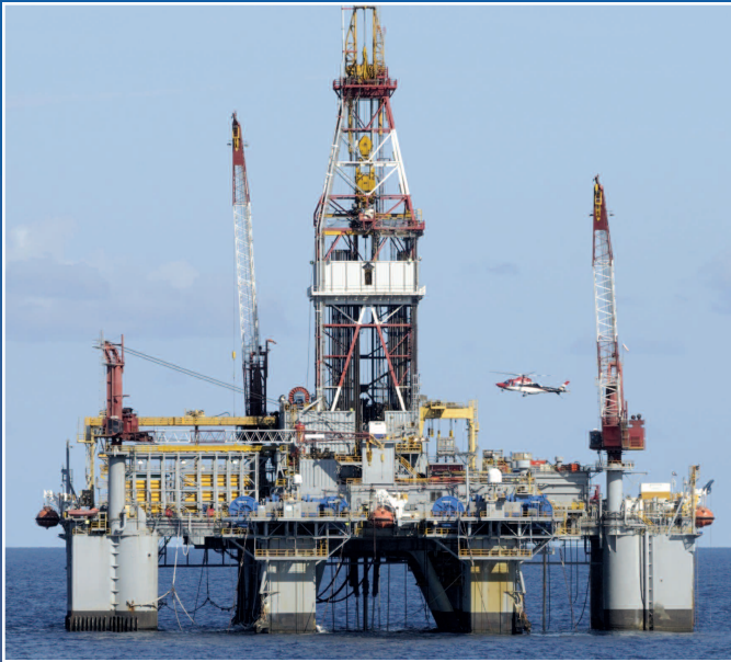
Xylan offers multiple benefits for oil rigs...