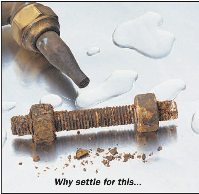
Why settle for this...