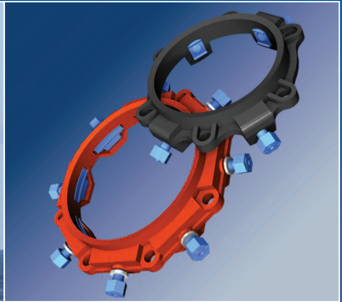
Provides controlled friction and corrosion resistance...