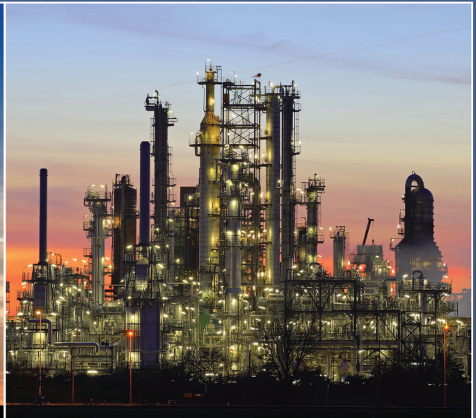
Solves many problems at chemical processing plants...