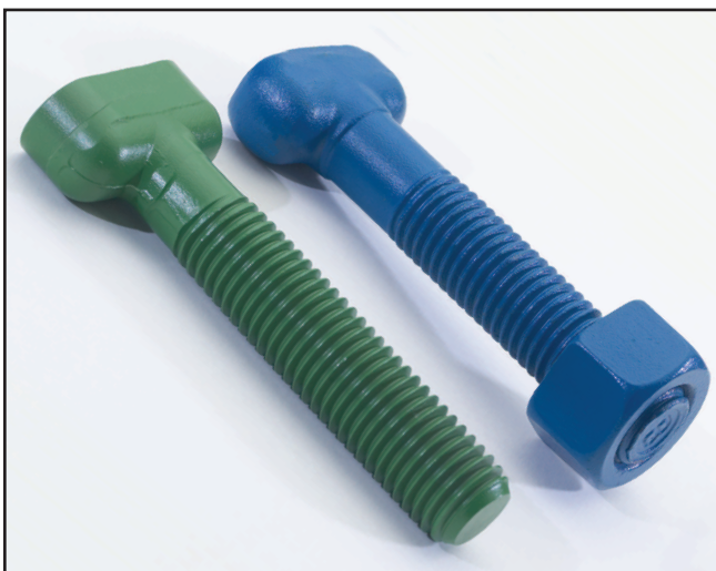
Xylan offers fasteners such as T-Bolts controlled torque, corrosion resistance and color-coding.

Xylan coatings solve as many problems for the oil industry as they do for waterworks.