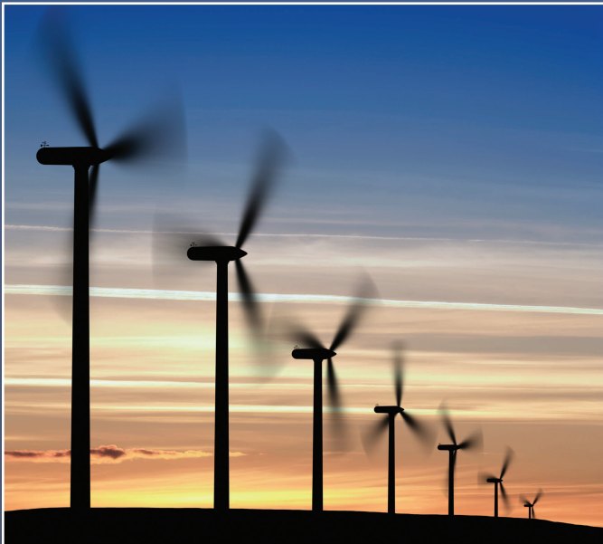
Xylan keeps wind farms running smoothly...