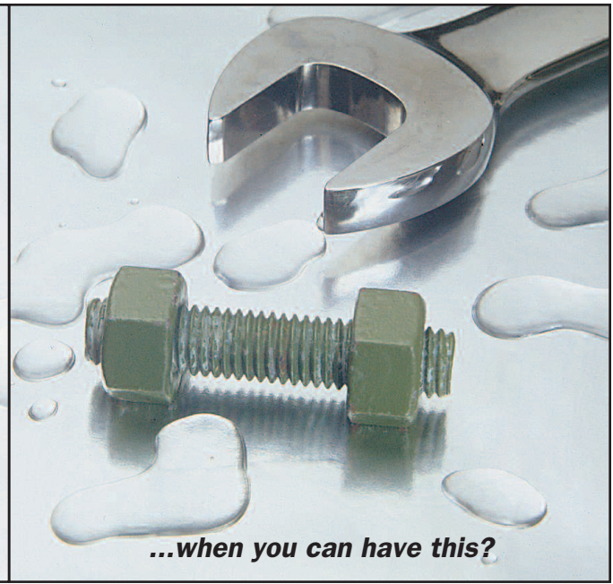
...when you can have this?